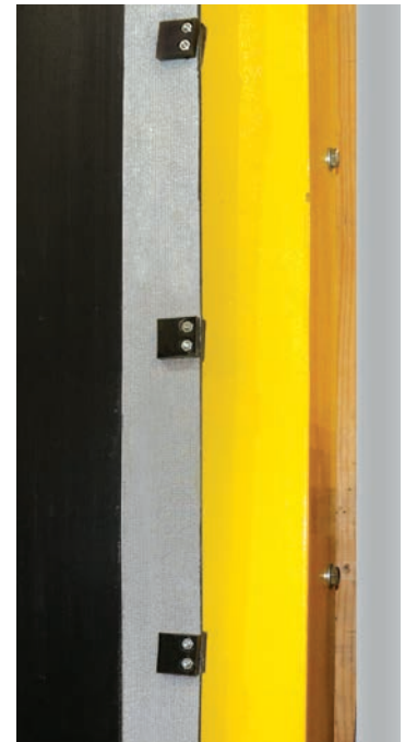
Continuous curtain locks on both edges

* Pressure/wind resistance value is the ultimate pressure tested at door width of 19'.